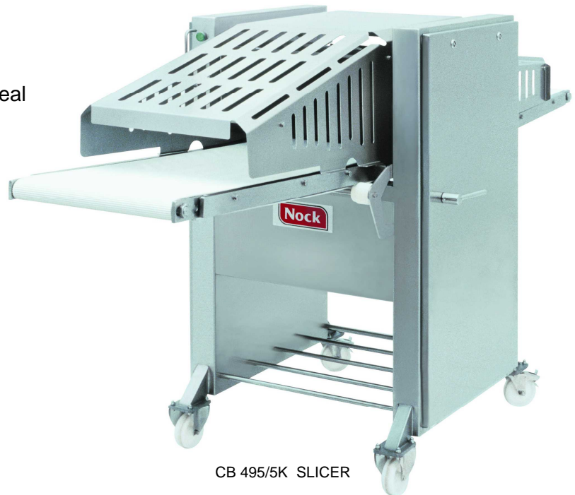
CB 495/5K SLICER