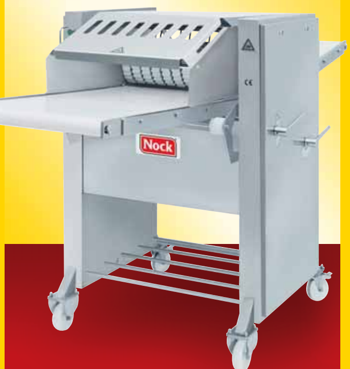
Cortex CB 595 • CB 695 • CB 795