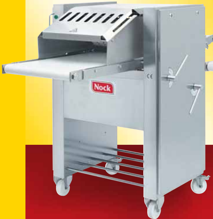
Cortex CB 435/5 • CB 495/5

The conveyorised NOCK derinding machines for industrial use are equipped with longer conveyor belts and operate with high cutting speeds. They may not be operated in open top (manual) operation.