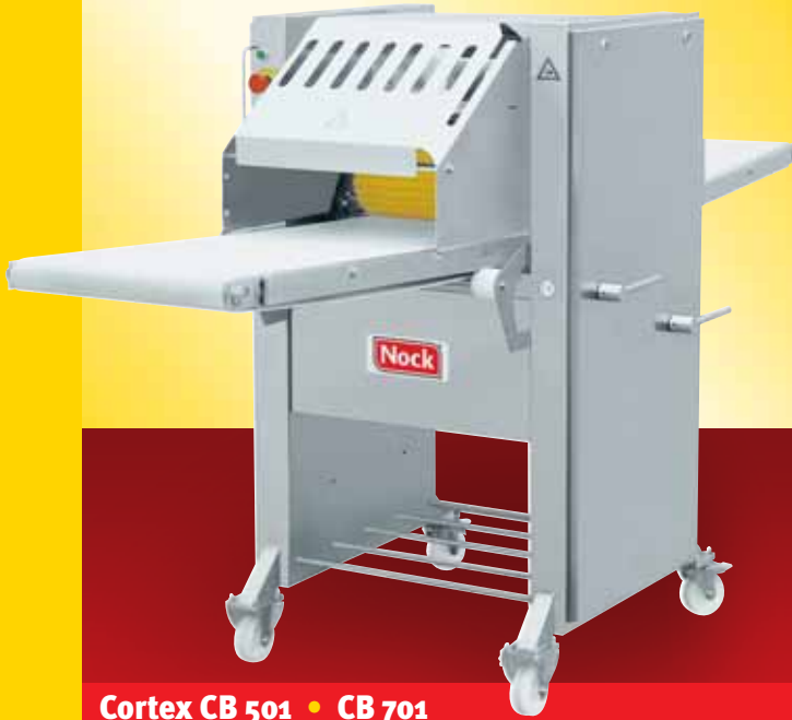
Cortex CB 501 • CB 701