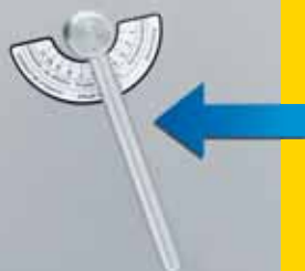
Operating lever for adjusting the height of the pressure roller