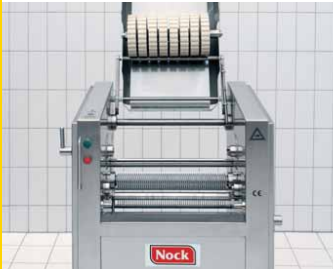
Quick and easy to clean: NOCK derinder after removing conveyor belts, pressure roller and blade holder. Scrapper comb tilted back.

The machines can be optionally equipped with plastic modular belts.