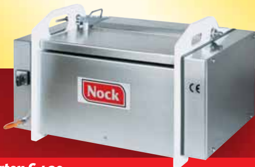
Cortex C 420