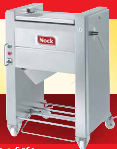
Cortex C 460 • C 560

Safety notice: Flat pieces may only be derinded with an automatic conveyor belt machine according to EN 12355.