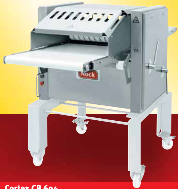
Cortex CB 604