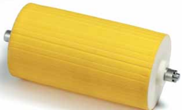
Inflated pressure balloon for NOCK conveyor belt derinding machines (optional)